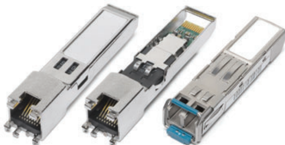
SFP modules: copper and fiber

is a key ingredient for any type of SGMII/SERDES/copper combination application. The small footprint facilitates SFP module applications, while the auto-media detect capability offers flexible media support.